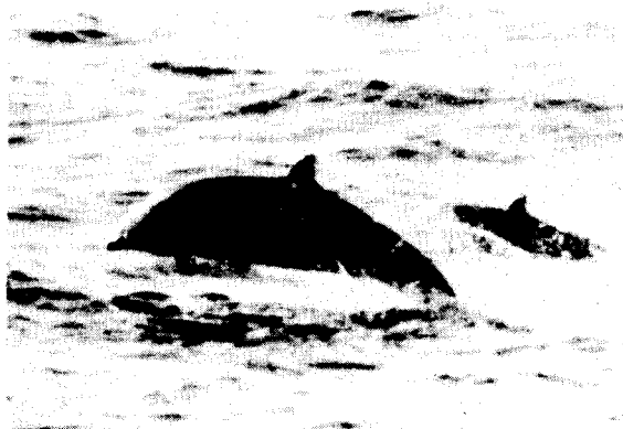
Fig. 4 Photo of dolphin sighted by Balcomb northeast of Phoenix Islands.

The widely separated localities of collection reported here (Fig. 3) and the close similarity of the specimens to each other