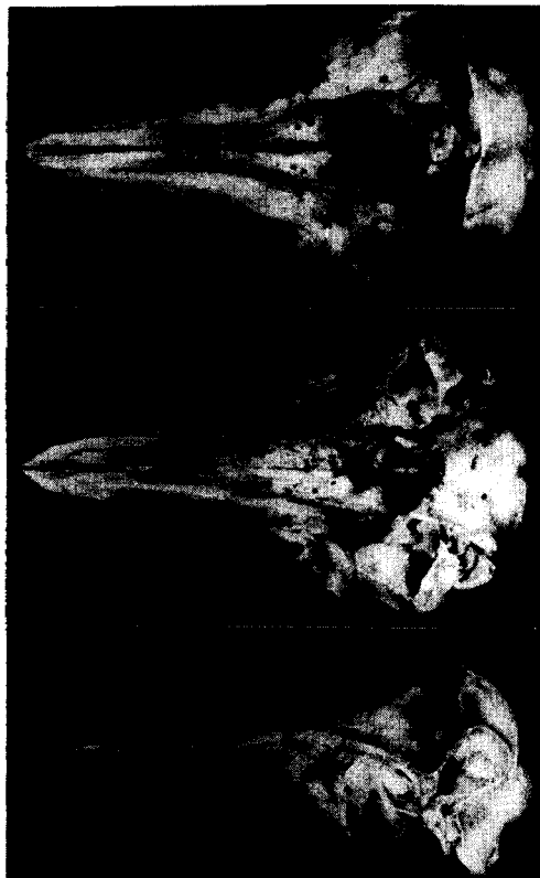
Fig. 2 Dorsal, ventral and lateral views of cranium of PBB71/4 (SAM 36323).

The pattern may be considered in terms of interacting components, as has been done for other delphinids 4 , as a basic "cape pattern" and a "dorsal field overlay". The ventral margin of the cape (best seen in the calf, Fig. 1c and d) arises at the apex of the melon, passes about 6 cm over the eye, dips ventrad to a low point about halfway between flipper base and dorsal fin, and then sweeps dorsad to an area between