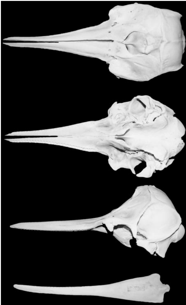
FIG. 2. Dorsal, ventral, and lateral views of cranium and lateral view of mandible of an adult Sousa chinensis (female) from Hong Kong (OPCF SC97-31/05-B). Greatest length of cranium is 507 mm.

GENERAL CHARACTERS. Indo-Pacific humpback dolphins are medium-sized dolphins, up to 2.8 m in length (Ross et al. 1994). Maximum weight is 250–280 kg (Jefferson 2000; Ross et al. 1994). In southern African waters, Indo-Pacific humpback dolphins are sexually dimorphic in length, with males (mean length = 226 cm, n = 29 ) larger than females (mean length = 216 cm, n = 10 —Ross et al. 1994). In Hong Kong, significant sexual dimorphism is not evident (Jefferson 2000).