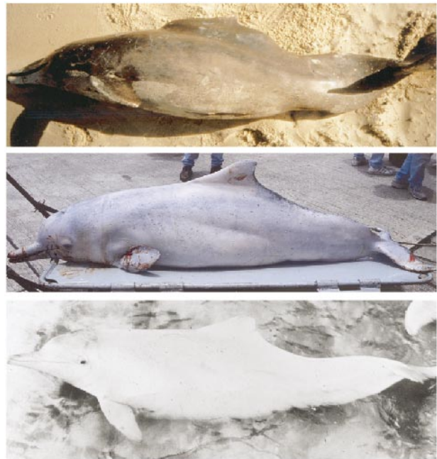
FIG. 1. External appearance of Sousa chinensis . Upper photo: from the Persian Gulf area, exhibiting darker coloration and exaggerated dorsal hump found in specimens from the western Indian Ocean. Lower 2 photos: from Hong Kong and Australia, showing light body color and absence of a dorsal hump, characteristic of animals from the eastern part of the range of the species.

Skull of Sousa chinensis is large, heavily built, and has a long, narrow rostrum, with concave margins (Fig. 2). Rostrum represents 57–67% of condylobasal length, which can reach at least 575 mm; Delphinus and Stenella are smaller (Ross et al. 1994). Distinctive features are very large and round temporal fossae (length 17–24% of condylobasal length), and separation of the pterygoids along base of rostrum (Ross et al. 1994). Mandibles of Sousa have concave margins, and mandibular symphysis is very long, ca. 21–28% of condylobasal length (Ross et al. 1994). These features distinguish Sousa from other genera in its range, except Steno . Skull of S. chinensis is easily confused with that of Steno bredanensis (rough-toothed dolphin), but the species can be distinguished by tooth counts (generally 30–38 in Sousa and 19–28 in Steno ) and size of orbit (generally <13% of condylobasal length in Sousa and >13% of condylobasal length in Steno —Miyazaki and Perrin 1994; Ross et al. 1994). In addition, teeth of Steno have deep longitudinal ridges, whereas those of Sousa have only slight ridges, if any.